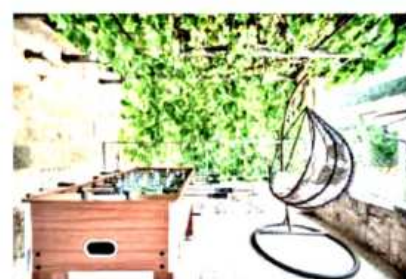
Prostor za razbibrigu