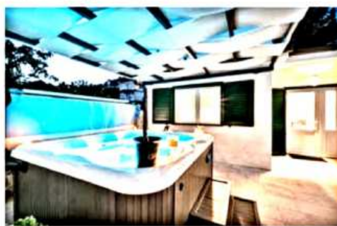
I jacuzzi je sjajno uklopljen u starinu