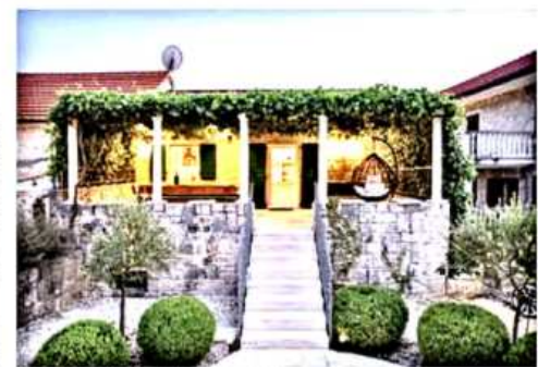
Kamen i zelenilo dobitan su spoj