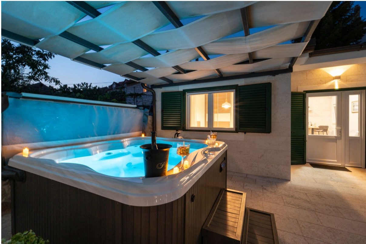
Even the jacuzzi fits perfectly into the traditional environment