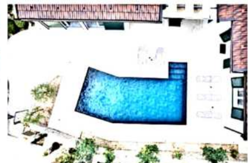
Bazen za potpuni ugođaj

'Aurora' je još jedan divan primjer spoja prošlosti i sadašnjosti. Nakon 114 godina, svaki kamen tada ugrađen u tri skromne kućice danas je pravo zlato 'Aurore'