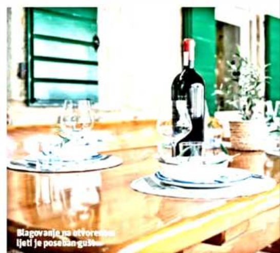
Blagovanje na otvorenom ljeti je posebno gušće