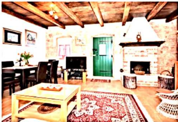
Ništa u kući nije podređeno trendu

– Inače sam po struci diplomirani inženjer građevinarstva – nastavlja Josip – pa sam pro-