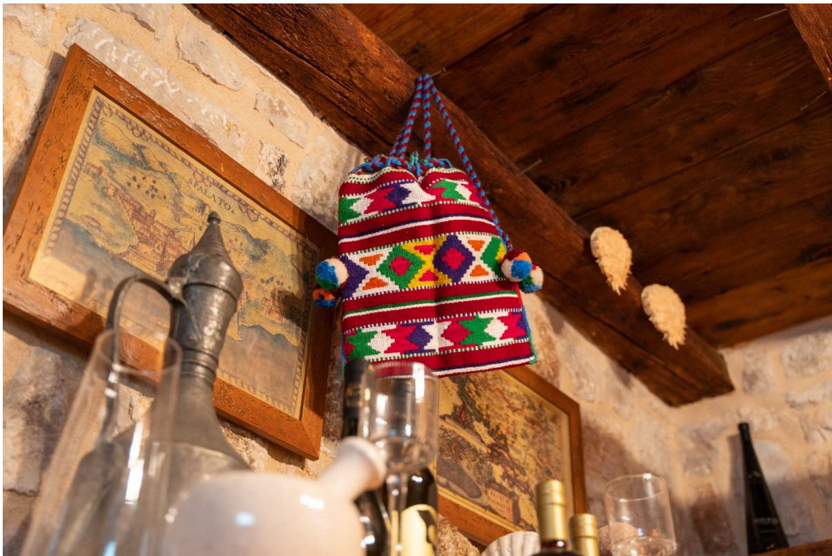
Your grandma living in the countryside surely had one just like it