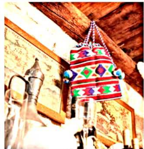
Sigurno je i vaša baka na selu imala jednu ovakvu