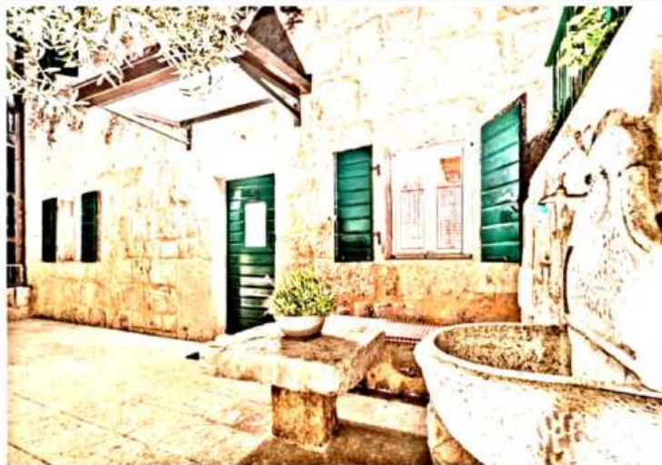
Niti jedan stari kamen nije uklonjen