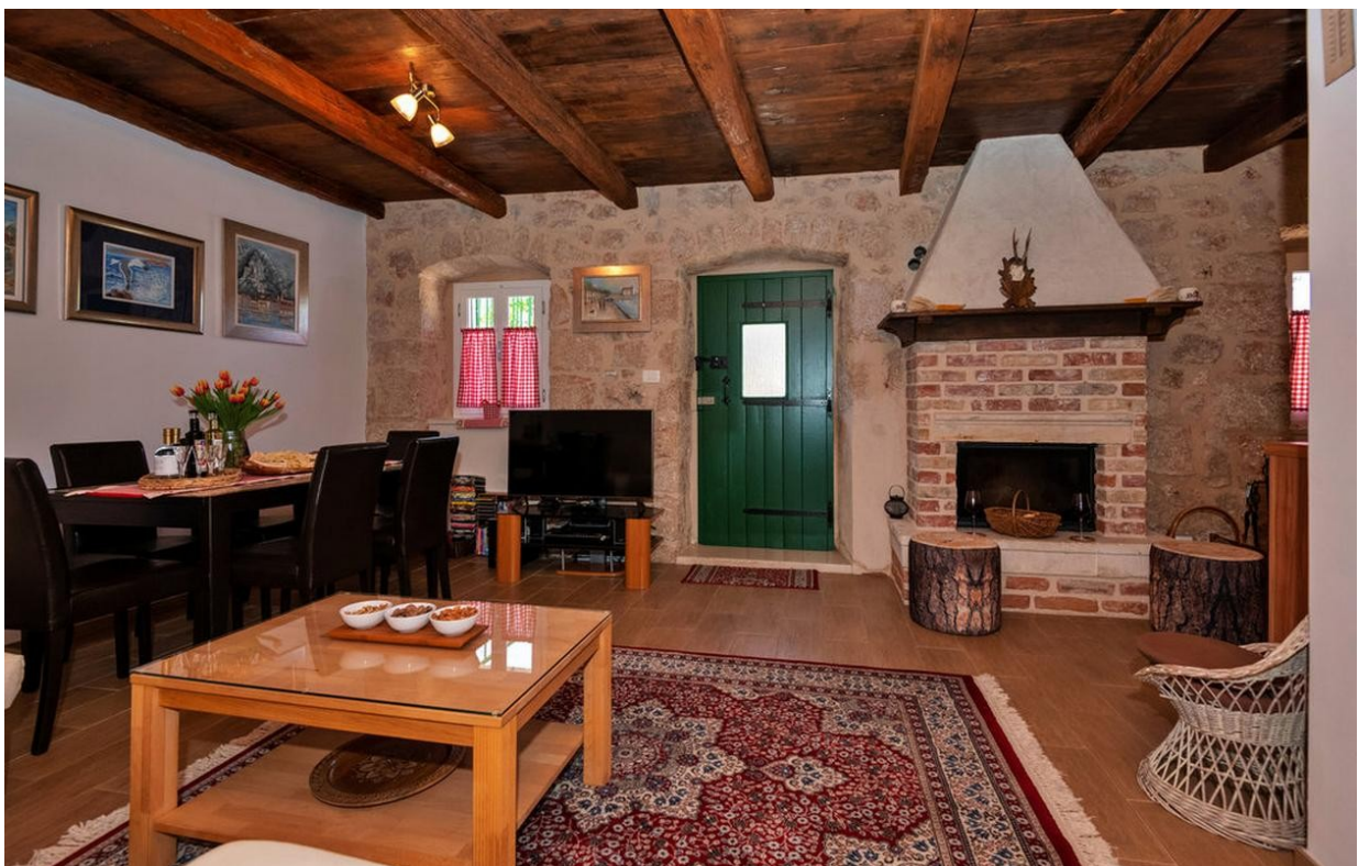
No detail in the house bows to fleeting trends