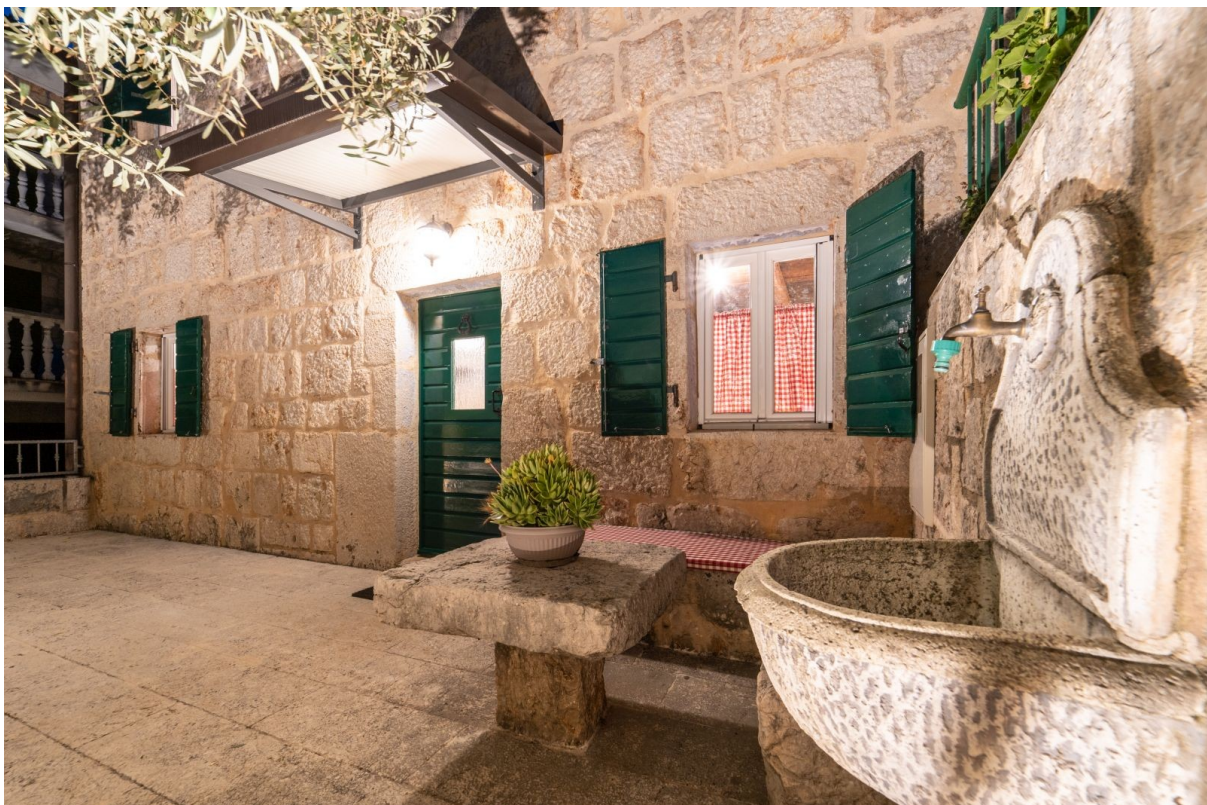
Not one of the old stones was removed

Villa Aurora is another wonderful example of a fusion of past and present. Today, after 114 years, every stone used in the construction of the three original small houses has become a priceless treasure nestled within Aurora