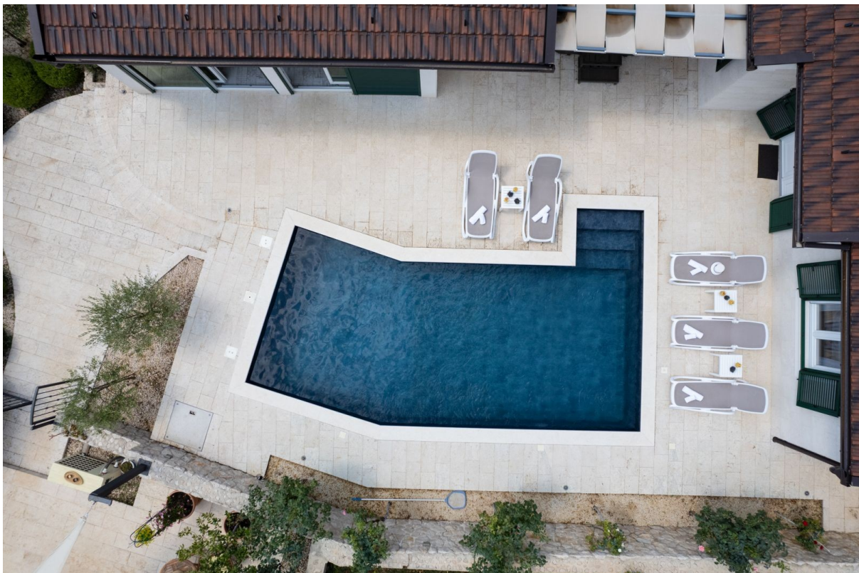
The pool adds the finishing touch