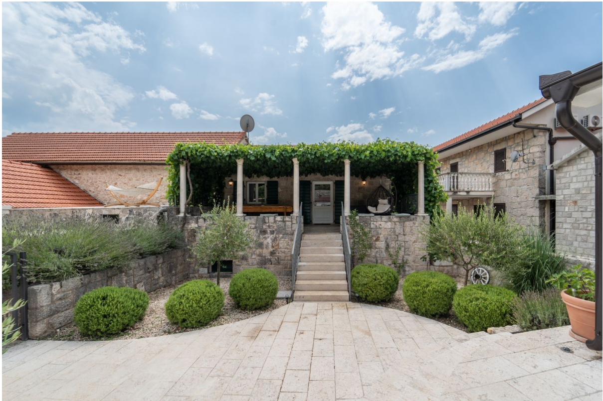
Stone and greenery are a winning combination